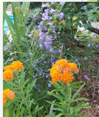
Orange Butterfly milkweed & blue Harebell are a fantastic colour combo.