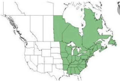
Native Range of Chelone glabra .

The erect stems with bright green foliage are topped with white, sometimes pink tinged flowers in dense spikes. The flowers open at intervals beginning at the bottom of the spike. Each bloom has the distinctive turtlehead shape that gives the plant its common name. The botanical name, Chelone , is Greek meaning tortoise and was the name of a nymph who was turned into a turtle by a vengeful Zeus.